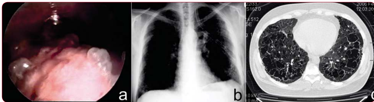
FIGURE 2. A) Intraoperative aspect (video); B) post-operative aspect: complete lung expansion (X-Ray); C) post-operative aspect – multiple cysts (CT).