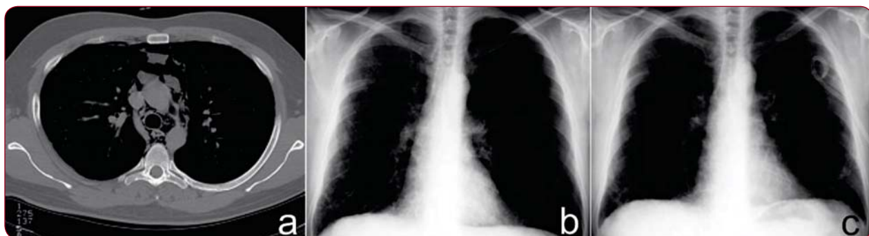
FIGURE 1. Preoperative aspects: A) pneumomediastinum (CT); B) left pneumothorax, before minimal pleurotomy (X-Ray); C) post minimal pleurotomy aspect: lung expansion (X-Ray).

First, multiple lung biopsies have been taken for histopathological examination and Langerhans cell histiocytosis immunohistochemical studies, then the biggest air cysts have been li-