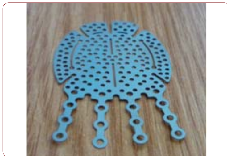
FIGURE 1. Titanium preformed floor plate.

In the past, the use of autogenic bone has been the gold standard in orbital wall reconstruction. Usually calvarial bone was used due to maximal biocompatibility and low cost. However, the harvesting of autogenous bone is associated with donor site morbidity, variable degree of resorption, prolonged total operating time, postoperative pain, scarring. Also autologous bone grafts are usually rigid and cannot be bend to match the concave-convex shape of