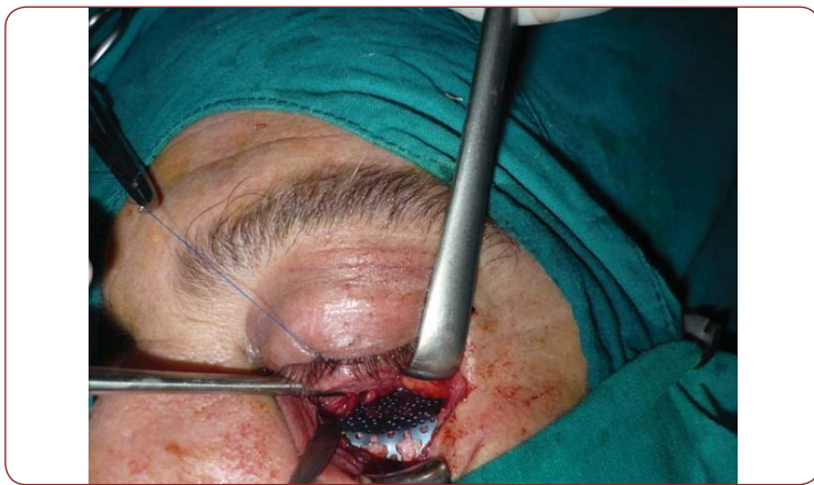
FIGURE 3. Orbital floor reconstruction.